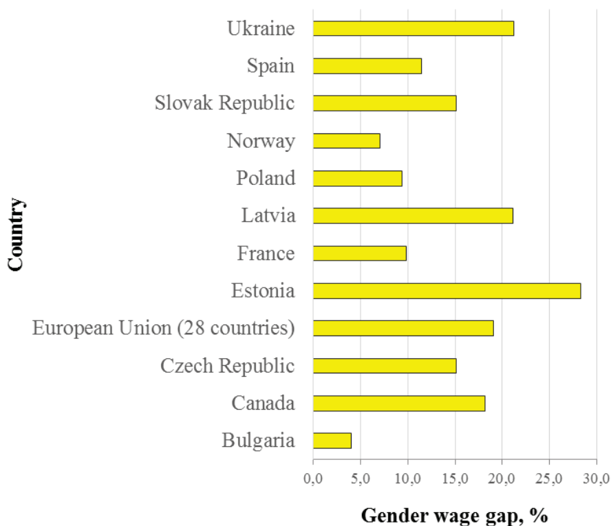
Fig. 3. Gender wage gap, Employees, Percentage, 2018 or latest available (United Nations Ukraine, 2020).

women's entrepreneurship is the formation of trust in SMEs in the community. The improvement of women's entrepreneurship image is the effective tool for this. The community should perceive women entrepreneurs as an important factor in job creation, meeting society's needs for goods and services, and filling local budgets. The positive image of women's entrepreneurship formation requires, among other things, self-organization of women entrepreneurs and their compliance with the principles of corporate social responsibility. To achieve that it is necessary: to provide business advice to women entrepreneurs provision; initial manuals on women's entrepreneurship development and publication.